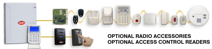
OPTIONAL RADIO ACCESSORIES OPTIONAL ACCESS CONTROL READERS